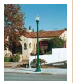
Historical... Classic... Contemporary... Holophane has a style that will fit your residential community.