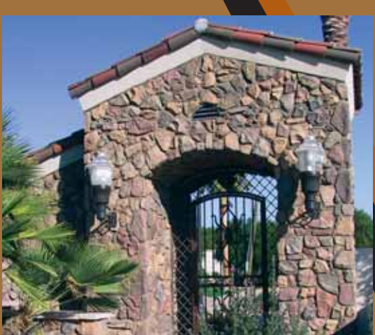
LEADER IN LIGHTING SOLUTIONS