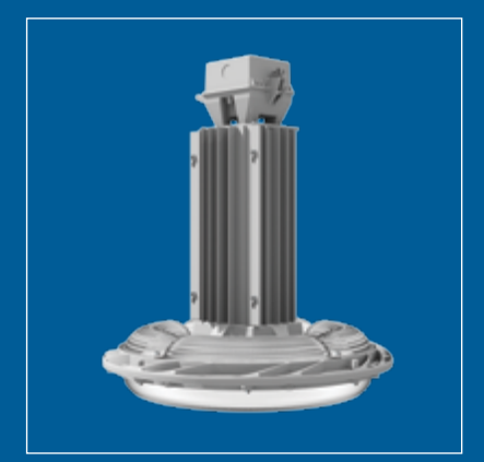
QDH quick disconnect mount